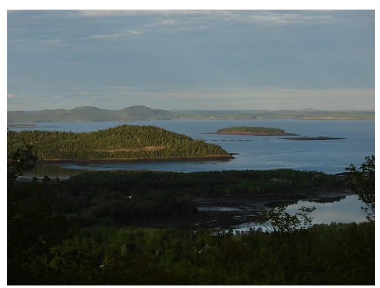
A beautiful view of the Bay of Fundy.